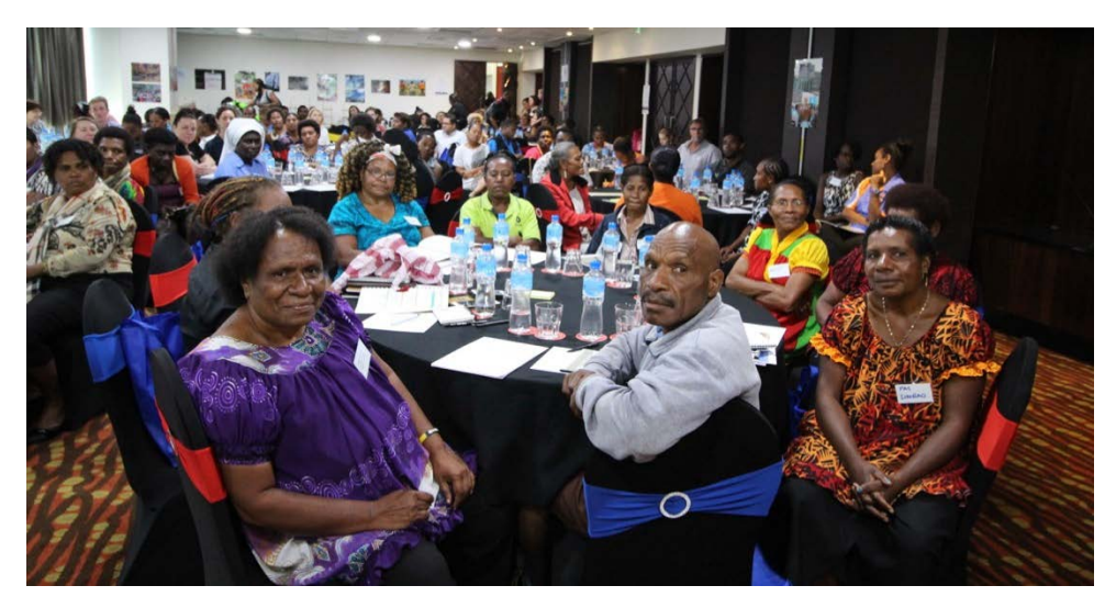
Workshop participants listen to morning presentations