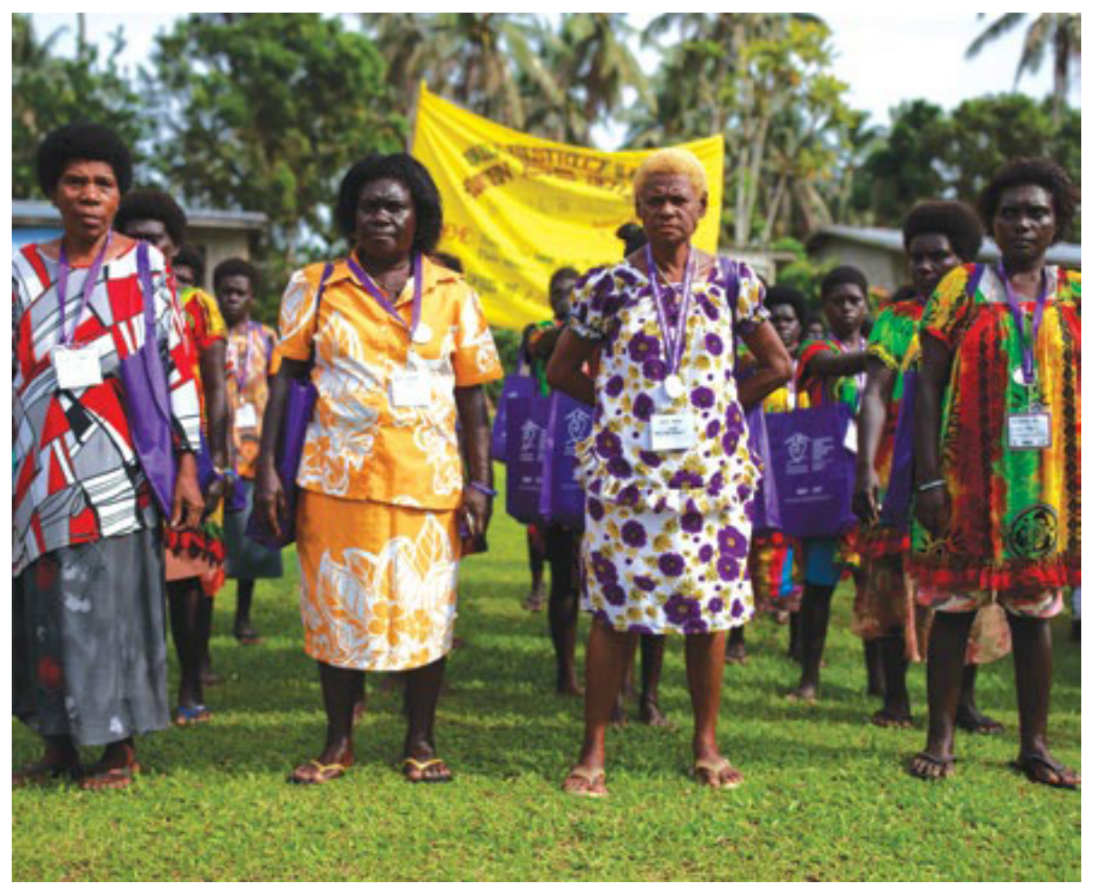
Women leaders at the Bougainville WHRDs Forum, Siwai (November 2017).

The From Gender Based Violence to Gender Justice and Healing project is supported by the Australian Government in partnership with the Autonomous Government of Bougainville and Government of Papua New Guinea as part of the Pacific Women Shaping Pacific Development program.