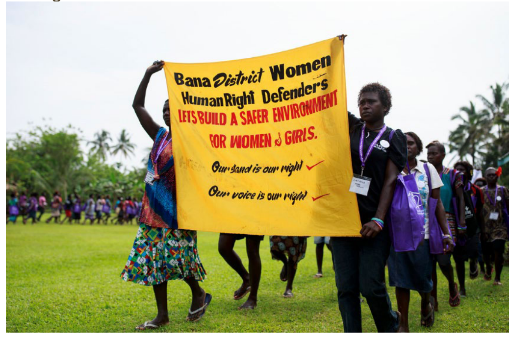
The president of Bana Women Human Rights Defenders, a young WHRDs, is leading her group at the Bougainville WHRDs Forum (Siwai, November 2017).