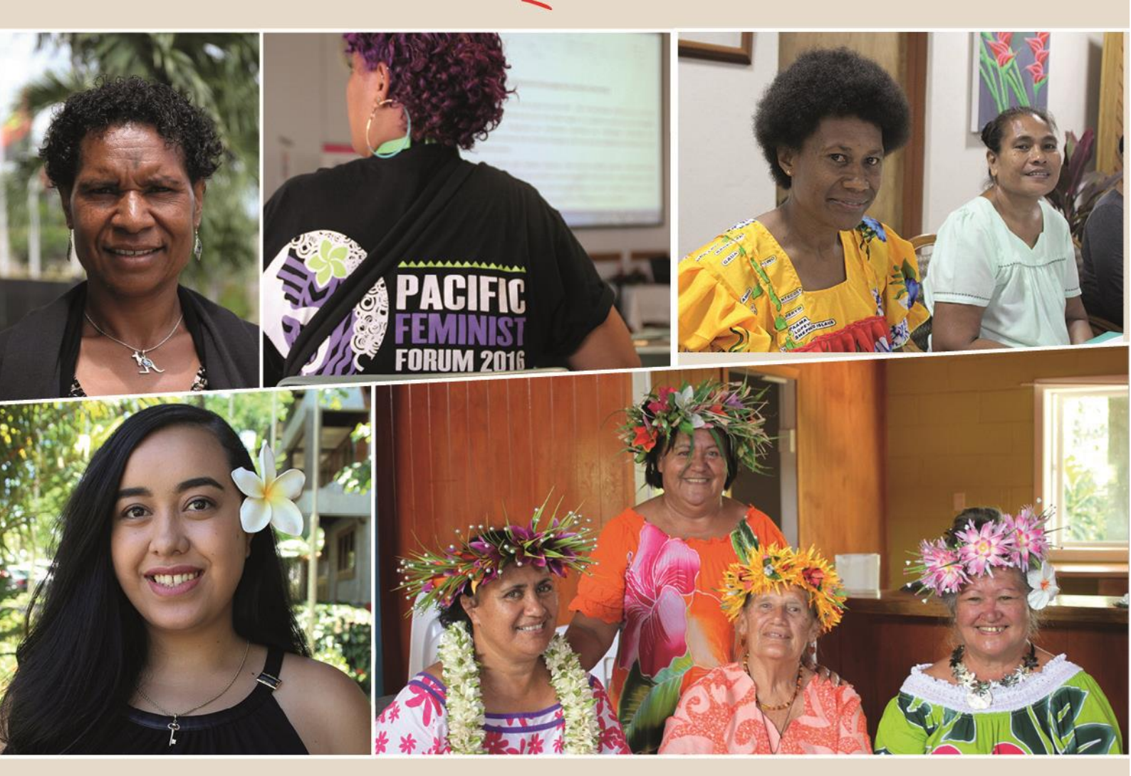
Fiji Country Review