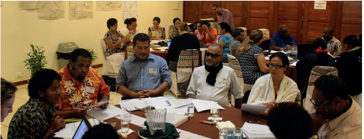
Fijian group working on refining the Pacific-INDIE